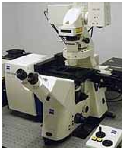
Something you might see on Sci-Fi: Optical Tweezers, from RPI Biotech lab.

Employers have mixed views on how to best use community college resources in their businesses, due to the cost, varying levels of responsiveness, and ease of access. Some colleges lean toward preparing transfers to four-year colleges, while others concentrate on “terminal” two-year degree programs. While recent changes have sped up the State’s program approval process, making it easier for colleges to respond to employer requests in a quicker manner, the credit and non-credit sides often do not communicate or coordinate their efforts. There is also little communication between colleges, according to college administrators.