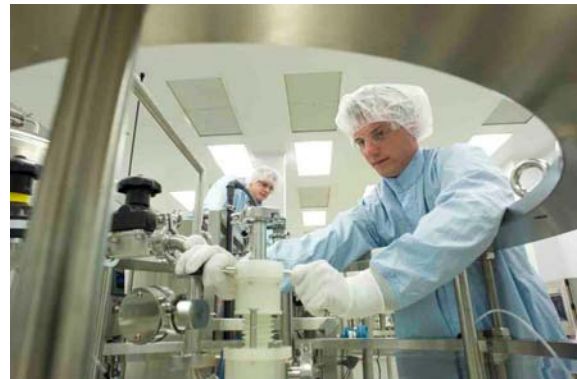
Technician making adjustments at Regeneron Pharmaceuticals, Inc.