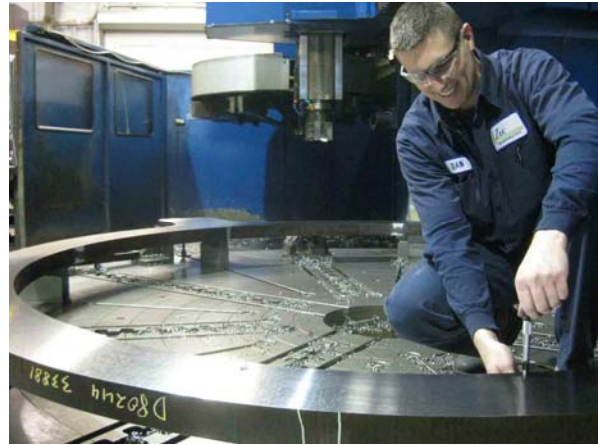
Using a micrometer for precision - Zak, Inc.

Given the need to bring more people into the workforce, it seems logical that efforts should be made to encourage participation by the unemployed, the underemployed, the displaced, and the discouraged.