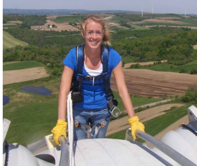
GE Wind Energy Learning Center employee, 250 feet in the air servicing a GE 1.5 MW Wind Turbine.