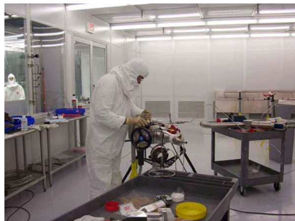
Orbital welding stainless steel tubing for a high purity gas delivery system by a TFS technician